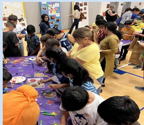
Crafts during the Festival of Lights event

Friday, we started the day off with many creative choices for Anything But A Backpack, then had an amazing turnout for Game Time in the library during lunch, and our day ended with a wonderful Festival of Lights event in the Cafeteria! The enthusiasm behind each event today made for a wonderful way to end the week. Thank you to everyone who participated and made each event possible. We have a wonderful school community that I am proud to be part of!!